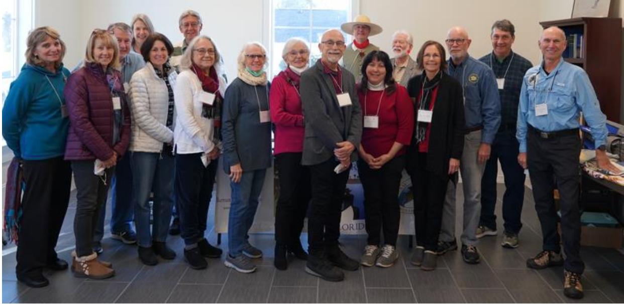
Florida Contingent at the Bartram Trail Conference in Darien, GA